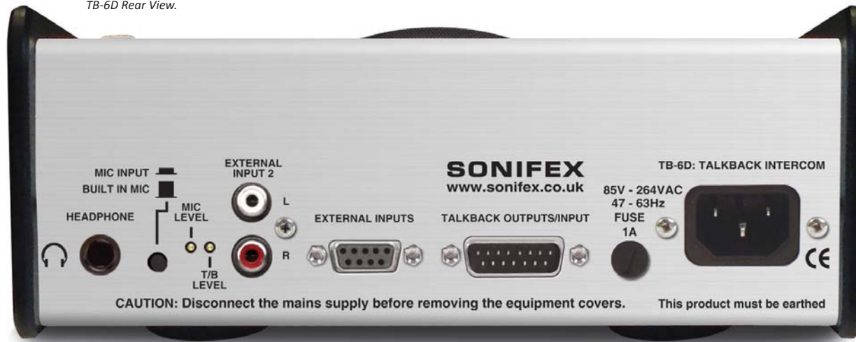
TB-6D Rear View.

For monitoring, you can use either the built-in 1W loudspeaker, or headphones on a 6.35mm unbalanced stereo jack. The headphone output provides 150mW into 32-600Ω headphones. When the headphones are used, the speaker is automatically muted. The monitor speaker can be muted via a remote contact on the 9 pin D-type External Input connector, e.g., when used in an area with live microphones. Both monitor and headphone levels are fully adjustable between -60dB and 9dB using the front panel volume control.