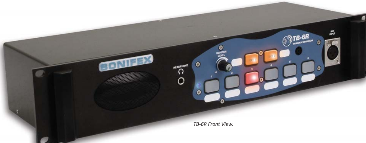
TB-6R Front View.