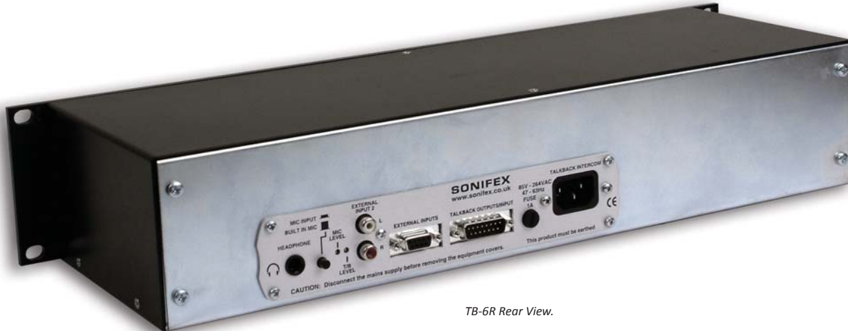
TB-6R Rear View.