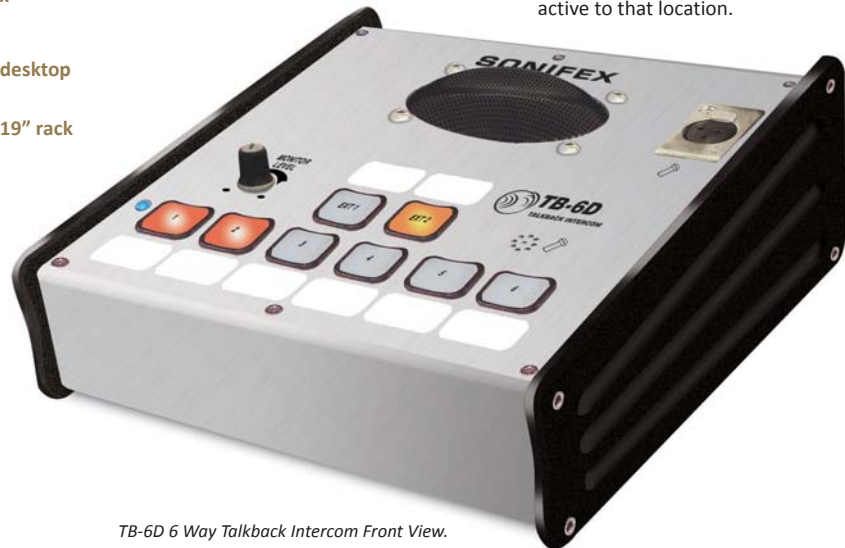
TB-6D 6 Way Talkback Intercom Front View.

On each panel, there are 6 front panel buttons for talkback selection and 2 for external inputs. When a button is pressed, the button lights up and the talkback is active to that location.