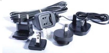
Standard DC Power Supply with Plug Adapters.