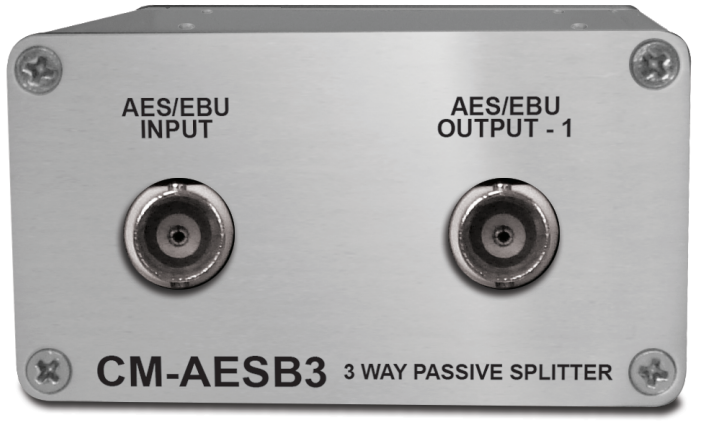
Fig 1-3: CM-AESB3 Front View