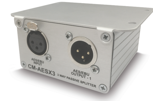
Fig A: CM-MNT1 Desk-Mount Plate Fitted on CM-AESX3

All of the products, along with the CM-TBU and CM-TLL, can be mounted to the underside of a desk using the CM-MNT1 desk mount plate. This fixes to the top side of the product and screws to the underside of a surface.