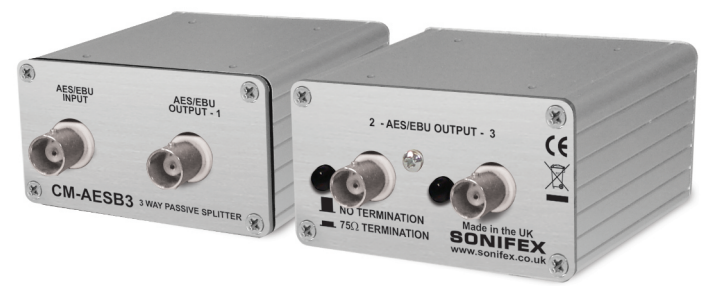
Fig 1-1: CM-AESB3 Front & Rear View

The CM-AESB3 is a passive digital splitter, designed to split a single AES3ID source to up to three destinations, using BNC connectors. 75\Omega termination can be applied, if desired to unconnected outputs. The CM-AESB3 is a single "one-to-three" splitter housed in a small form box.