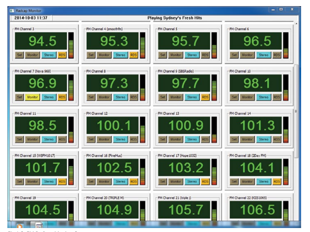
Fig 1-3: FM Radcap Monitor Screen

Windows 7, 8 & 10 provide similar functionality with their Listen option under the Recording device properties, allowing each station to be monitored on a designated audio output device.