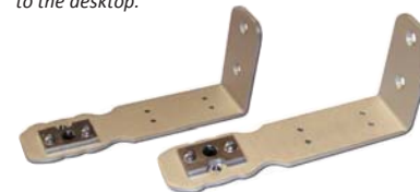
The LD-KC1 mounting kit.