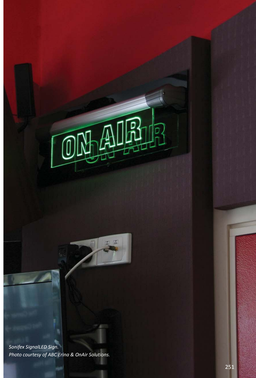
Sonifex SignalLED Sign.