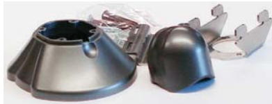
LD-KE1 End Mounting Kit For 40cm Or 20cm Flush Mounting Signs.

The sign is supplied as standard so that it can be mounted flush to a wall, e.g. for the 'TX' & 'REH' sign shown below. However, a mounting kit is available, LD-KE1, to mount the sign perpendicular to a wall, e.g. above a door, such as the ON AIR sign shown.