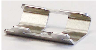
LD-IT LED Sign End Mounting Installation Tool.

The display mode and colour options are set-up using a separate remote control, the LD-RPC.