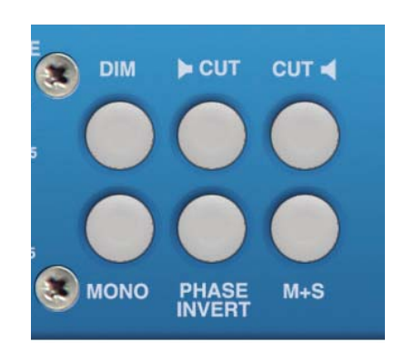
Six illuminated soft-touch pushbuttons.

Six illuminated soft-touch pushbuttons allow front panel muting and dimming of the loudspeakers, stereo-to-mono conversion, phase inversion and Middle+Side encoding/decoding with all front panel settings stored in non-volatile memory which is recalled at power-up. A universal power supply ensures global voltage operation without adjustment.