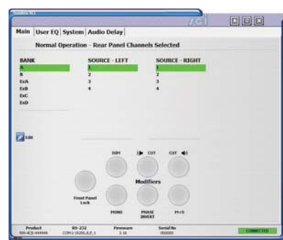
SCi Software Screen for RM-4C8-HD1.

For the technical specification please refer to the RM-HD1 card itself.