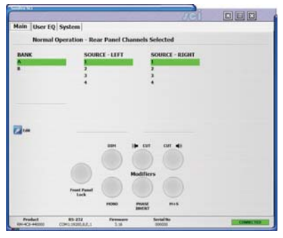
SCi Software Screen for RM-4C8.

With 4 x bright high-resolution 26-segment meter displays and separate left and right source selectors, the RM-4C8 is ideal for monitoring audio channels in an SDI group, or groups of de-embedded AES/EBU channels.