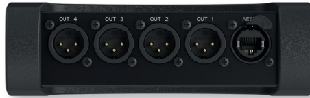
NA-4I4O-AES72 / back