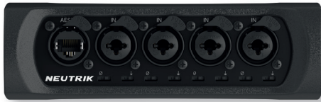
NA-4I4O-AES72 / front