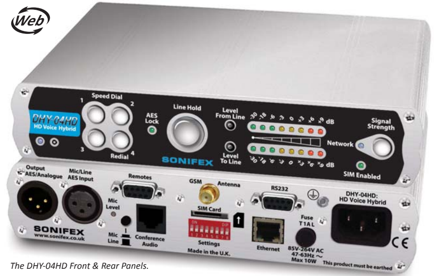
The DHY-04HD Front & Rear Panels.

The DHY-04HD HD Voice Hybrid is used on a 3G or GSM cellular (mobile) phone network instead of a telephone (POTS) line. The DHY-04HD can accept a SIM card in the rear panel slot and by connecting a suitable GSM antenna, it can receive and make high quality broadcast calls over the cellular network, converting the 3G or GSM call to the 4 wire audio signal to and from a connected mixing console. The module used in the DHY-04HD is quad-band GSM and 5 band UMTS/HSPA+, so it can take and make calls on any 2G GSM, or 3G network.