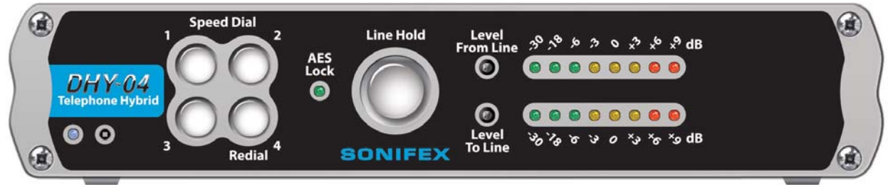
The DHY-04 Front Panel.