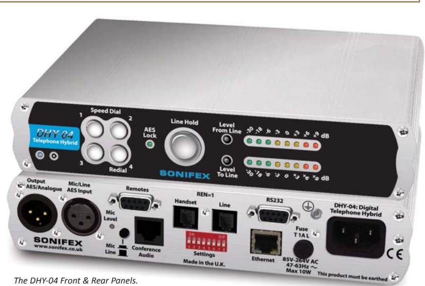
The DHY-04 Front & Rear Panels.