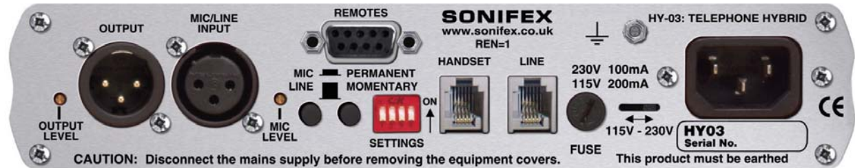
HY-03 Single Free-Standing Automatic Analogue TBU - Front & Rear.