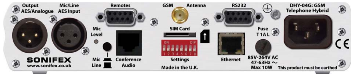
The DHY-04G Rear Panel.