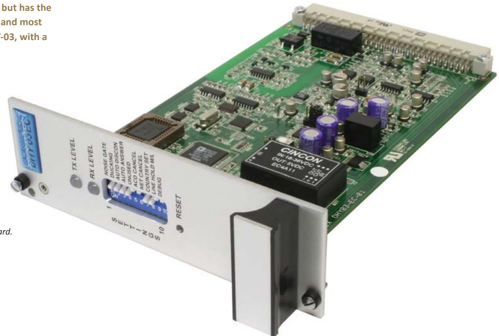
DHY-03EC - Automatic Digital Telephone Balance Unit Eurocard.