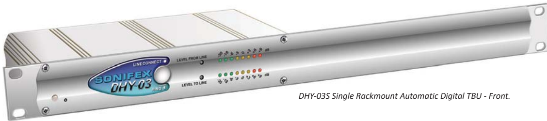
DHY-03S Single Rackmount Automatic Digital TBU - Front.