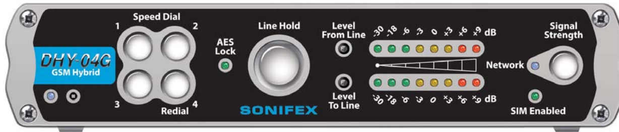
The DHY-04G Front Panel.