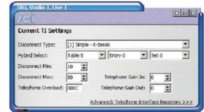
SCI Disconnect Method Settings Page.