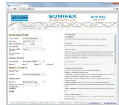
DHY-04G Configuration Page.