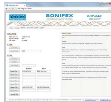
DHY-04G Home Page.