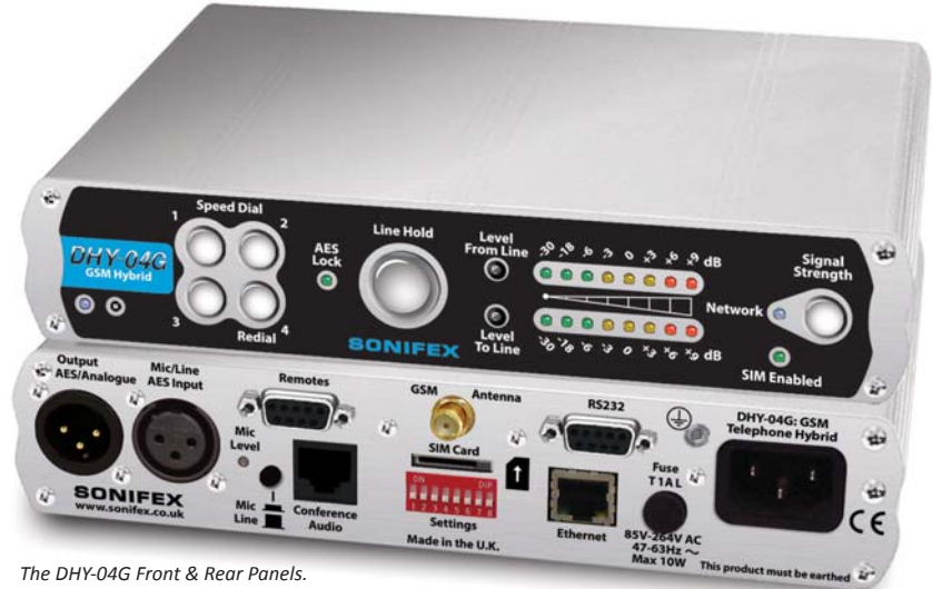
The DHY-04G Front & Rear Panels.

The DHY-04G has all features of the DHY-04 (read cellphone/mobile features instead of telephony features in the listed bullet point specification) together with some additional front panel indicators. There are two LEDs, one for SIM enabled and one for GSM Network availability. Additionally there is a push button which allows the GSM signal level to be displayed on the meter LEDs.