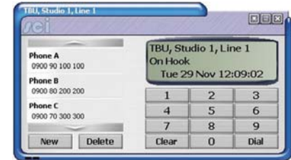
SCI Dialpad Home Page.

*Depth is measured from the front to the end of the connectors fitted to the back of the unit.