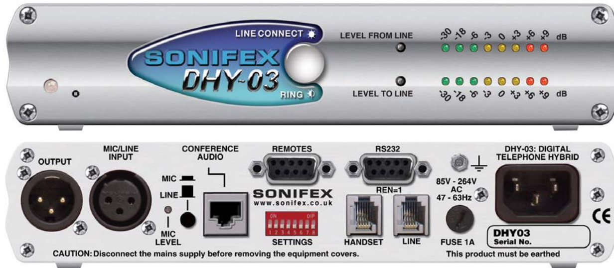
DHY-03 Single Free Standing Automatic Digital TBU - Front & Rear.