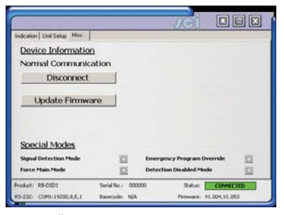
SCi Miscellaneous Page.