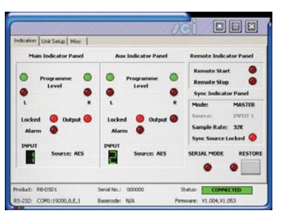
SCi Indicator Page.

The RB-DSD1 has been designed to have a passive signal path through the main input, so if power to the unit fails, signal input 1 is routed to output 1 and signal input 2 is routed to output 2. This is essential for applications such as installation at transmitter sites, where a power failure to the unit should not prevent the audio input signal from being output to the transmitter.